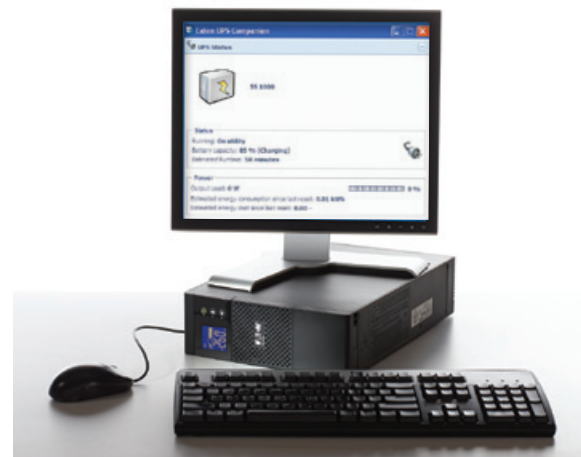
The 5S fits in small spaces and can also be used as a monitor stand.